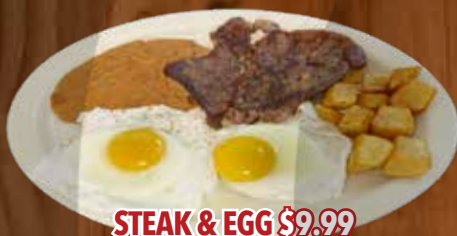
STEAK & EGG $9.99