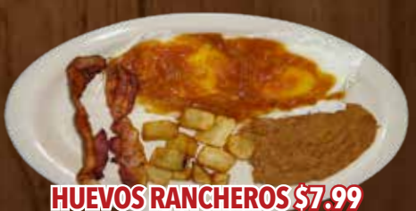
HUEVOS RANCHEROS $7.99

*Consuming raw or undercooked meat, poultry, eggs, shellfish, or seafood may increase your risk of foodborne illness.