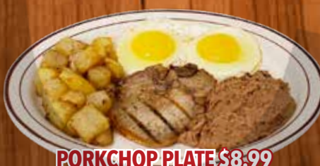
PORKCHOP PLATE $8.99