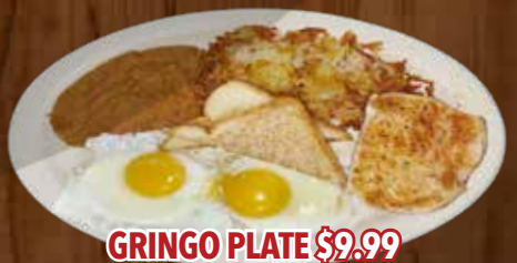
GRINGO PLATE $9.99