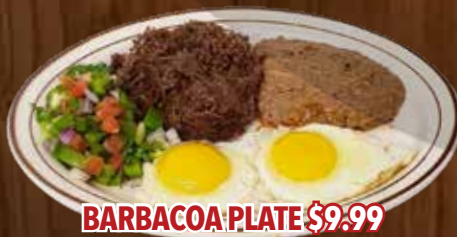
BARBACOA PLATE $9.99