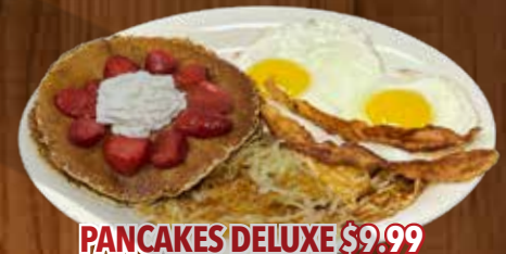
PANCAKES DELUXE $9.99