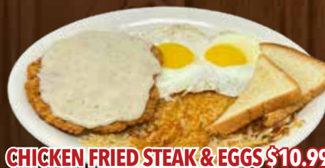
CHICKEN FRIED STEAK & EGGS $10.99