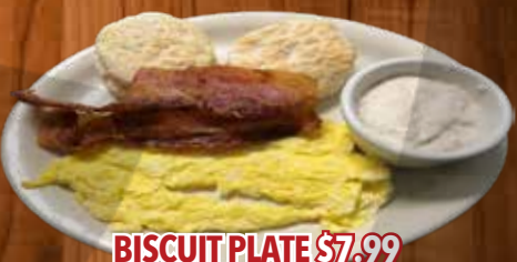
BISCUIT PLATE $7.99