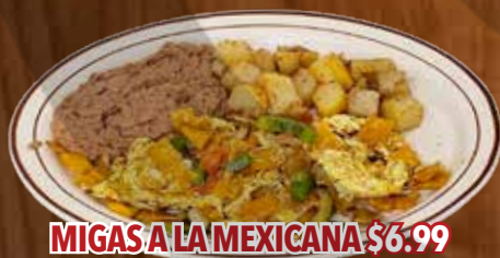
MIGAS A LA MEXICANA $6.99