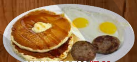
PANCAKES & EGG $7.99