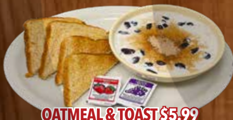
OATMEAL & TOAST $5.99