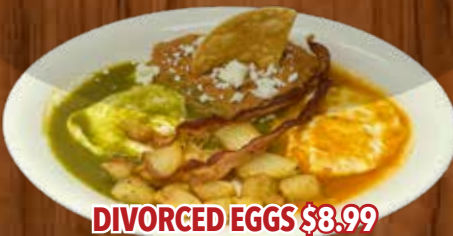
DIVORCED EGGS $8.99