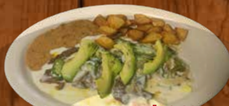
STEAK OMELETTE $10.99