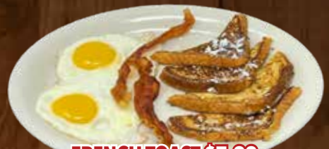
FRENCH TOAST $7.99