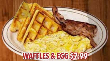
WAFFLES & EGG $7.99