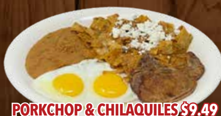
PORKCHOP & CHILAQUILES $9.49