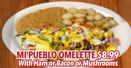
MI PUEBLO OMELETTE $8.99 With Ham or Bacon or Mushrooms