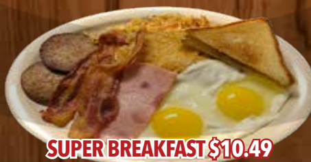
SUPER BREAKFAST $10.49