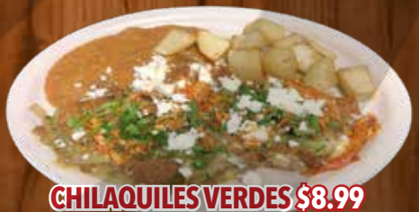
CHILAQUILES VERDES $8.99